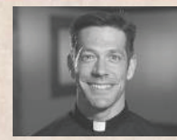
Fr. Mike Schmitz